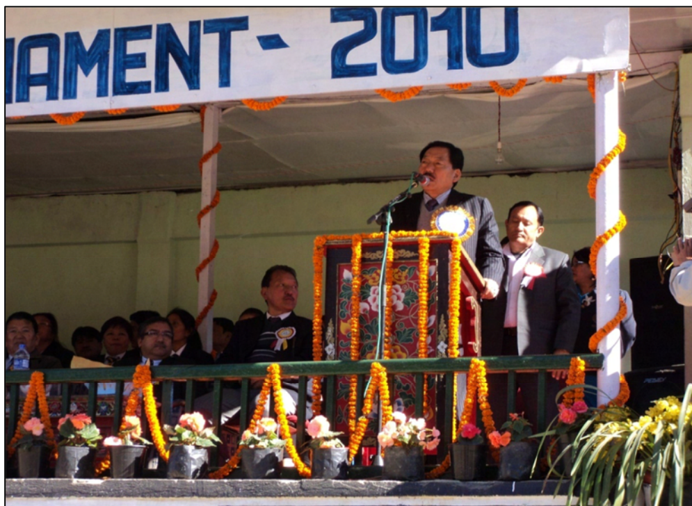
Hon'ble Chief Minister addressing the audience on the final day of the tournament

On the occasion of Christmas on 25th Dec 2010, 3rd inter village Volley ball tournament was organized by Ambotey village Sports Committee at Ambotey Chisopani, South Sikkim, Which was sponsored by DANS Group.