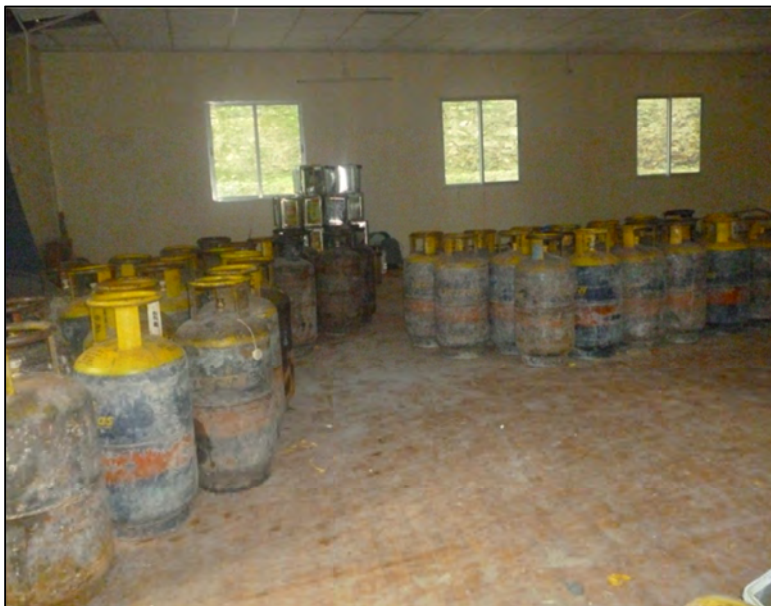
LPG Storage at Site