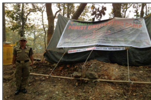
Forest Fire-Fighting Camp