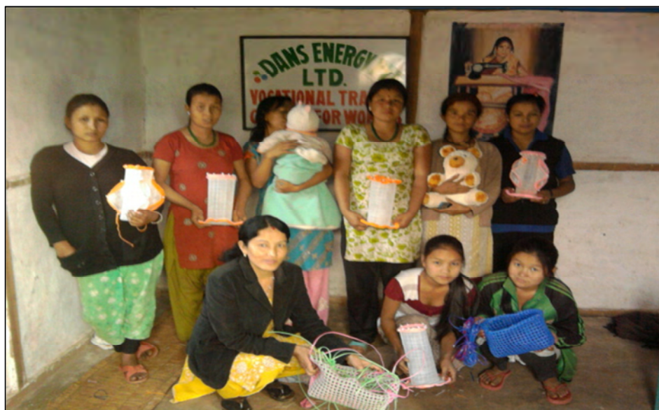
Women who enrolled for Vocational Training at Cutting and Tailoring Institute

To help more women train at the same time, in March 2013 three sets of tailoring machines were provided by the project authorities.