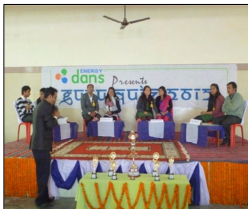
Final Round in Progress