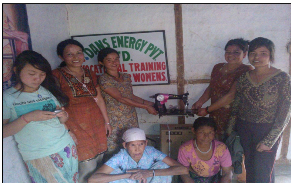
New Tailoring machines provided

To help more women train at the same time, in March 2013 three sets of tailoring machines were provided by the project authorities.