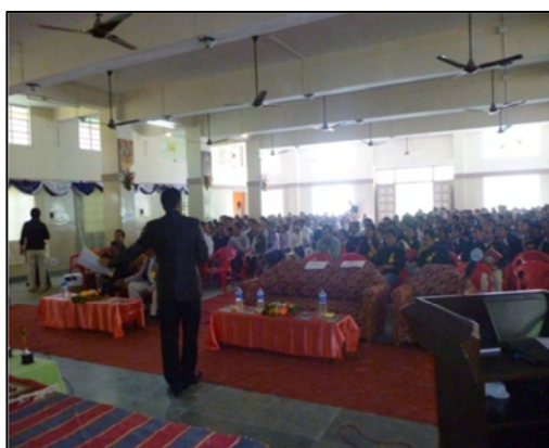
Overwhelming response at the GURU QUIZ

The winner of the competition was Temi Senior Secondary School, Jorethang Senior Secondary School and Naya Bazaar Secondary School. The winner received a cash prize of Rs.15,000, Rs.10,000 and Rs.5,000 respectively, sponsored by DANS Group.