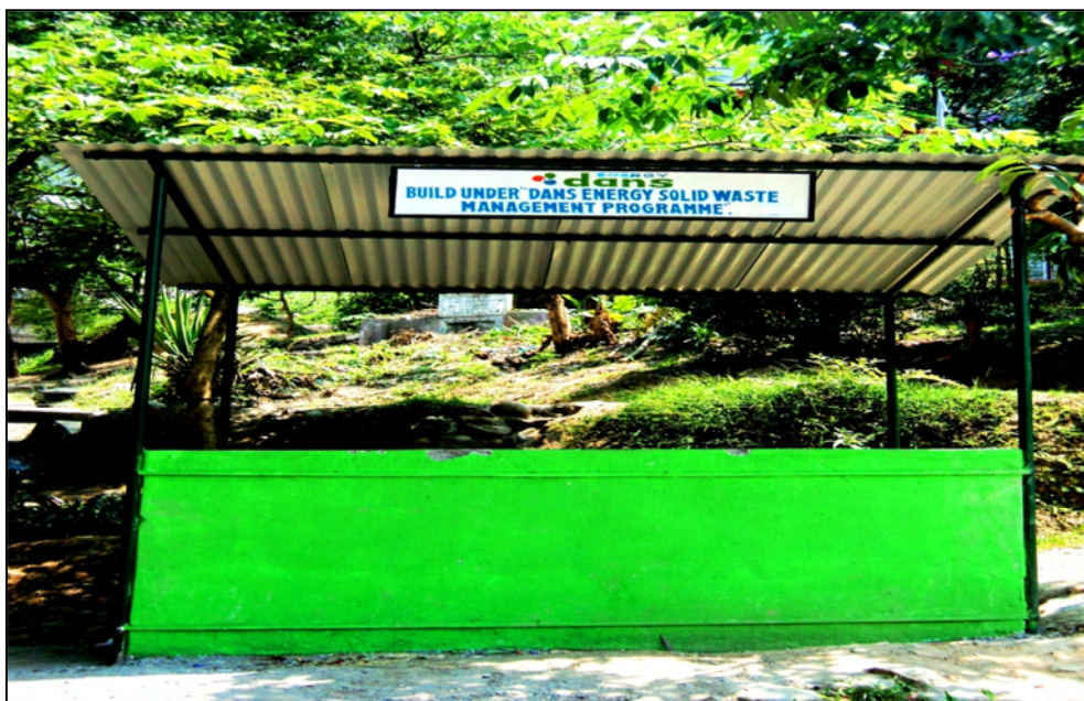
Eco-friendly Concrete garbage bins in association with the Dept. of UD&HD, Jorethang, South Sikkim