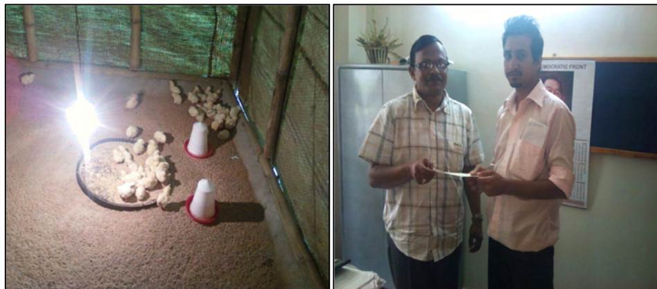
Assistance provided for making Poultry farm