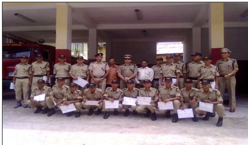
DANS RESCUE TEAM AT THE END OF TRAINING

DANS Group under the supervision of ex-Para-military officer selected the group of 19 local unemployed youths of Sikkim. They were selected after going through a series of physical and mental fitness tests. These youth were employed with an aim of securing the project area and building up a strong force to help local authorities during the times of natural calamities and other emergencies. It was also declared that these security personnel will always be ready in case of any kind of emergencies in and around Jorethang Area.