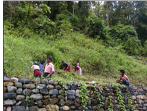
Saplings Plantation Drive